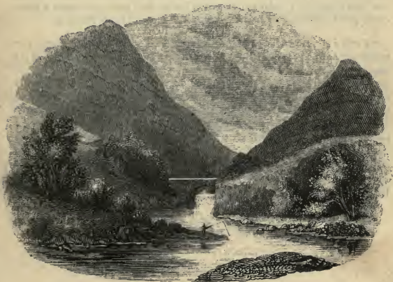
SALMON LEAP AT PONT ABERGLASLLYN.