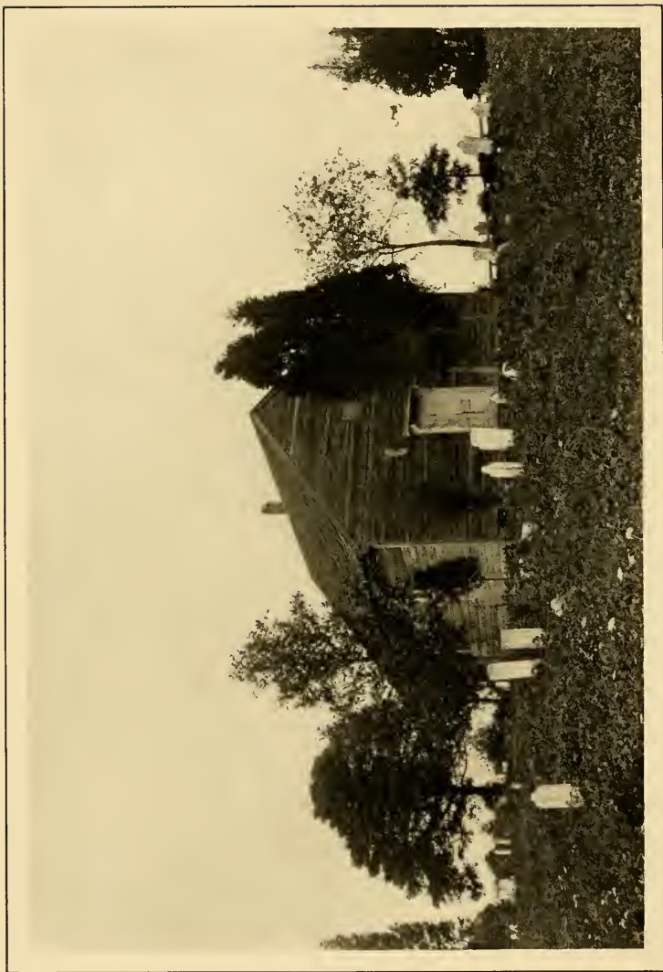
BETHEL BAPTIST MEETING HOUSE. BUILT A. D. 1786.