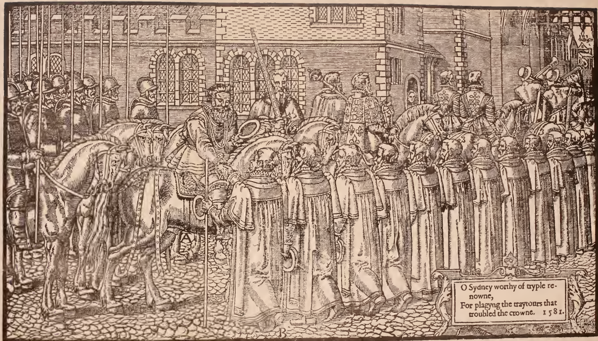
Reception of the lord deputy, sir Henry Sidney, at Dublin, by the Mayor and members of the Municipal Council.