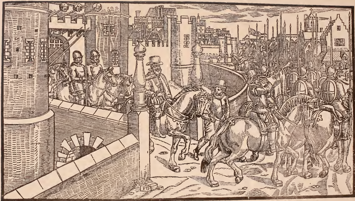
Departure of the lord deputy, sir Henry Sidney, from Dublin.