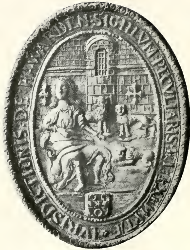
Seal of the " Peculiar and Exempt Jurisdiction " of Hawarden.