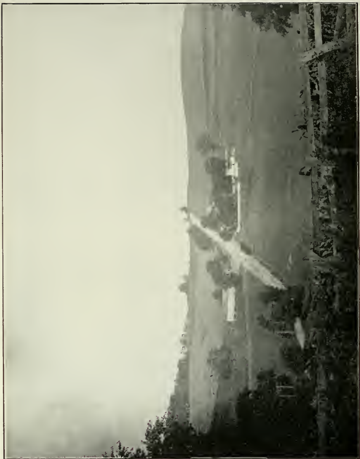
VILLAGE OF SEARIGHTS.