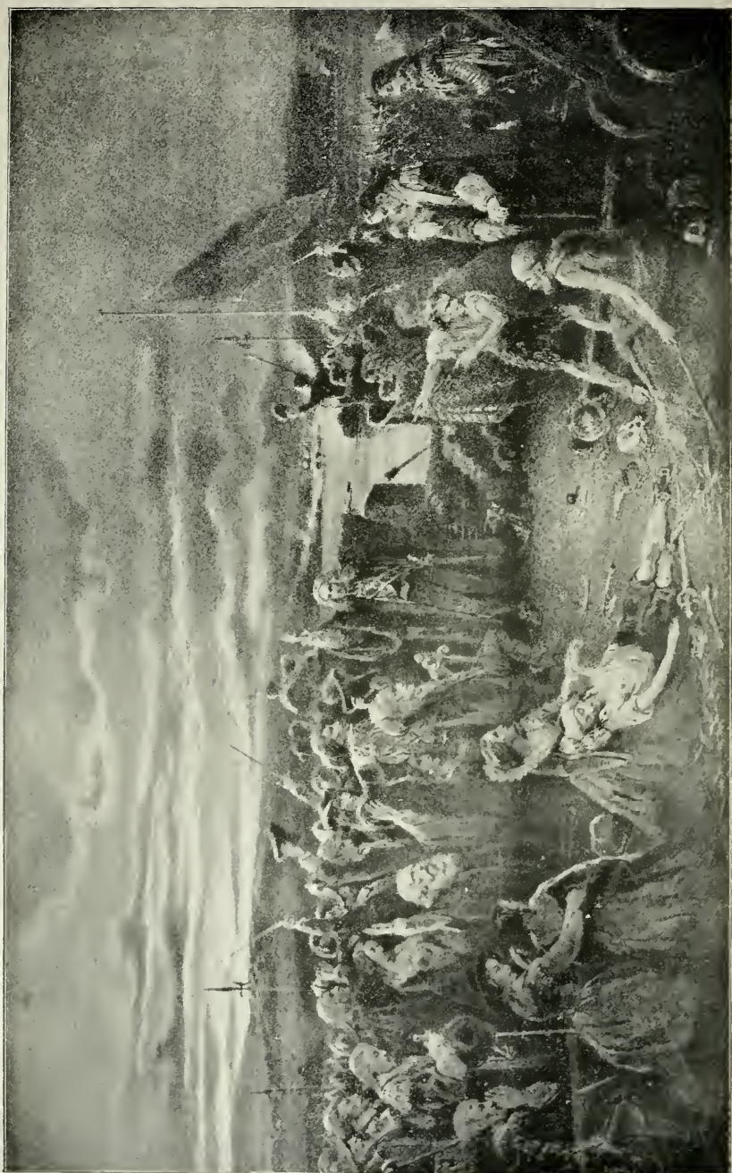
RELIEF OF DERRY, 1689.